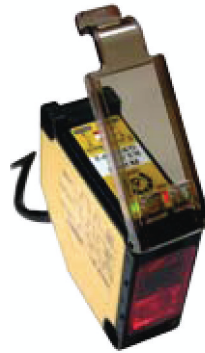
• RR-03 Reflector/鏡片